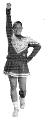
Hip High V