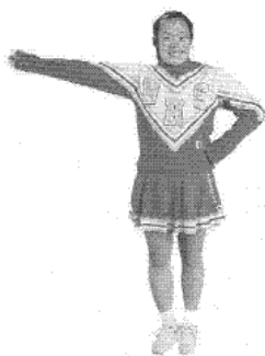
Broken Arm T